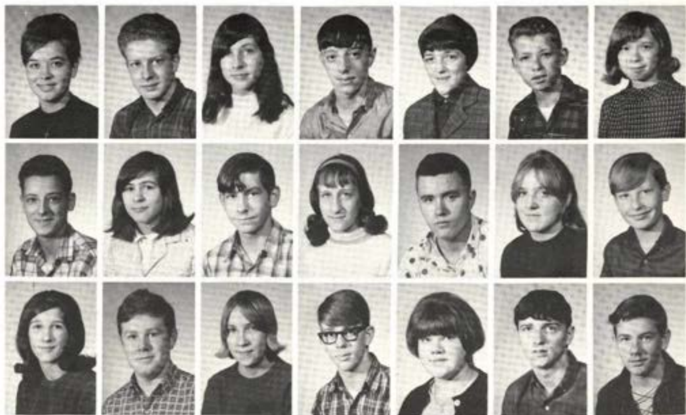
GRADE - 8