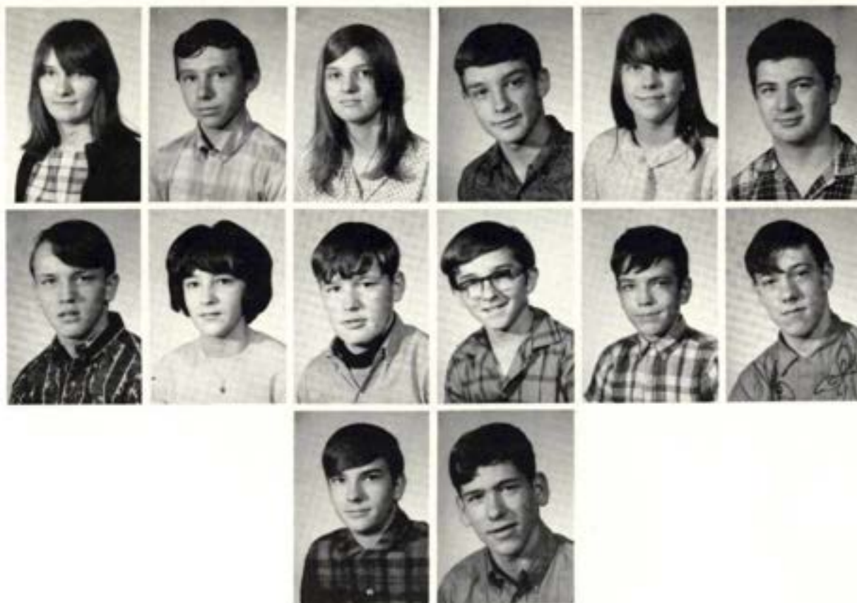
GRADE - 8