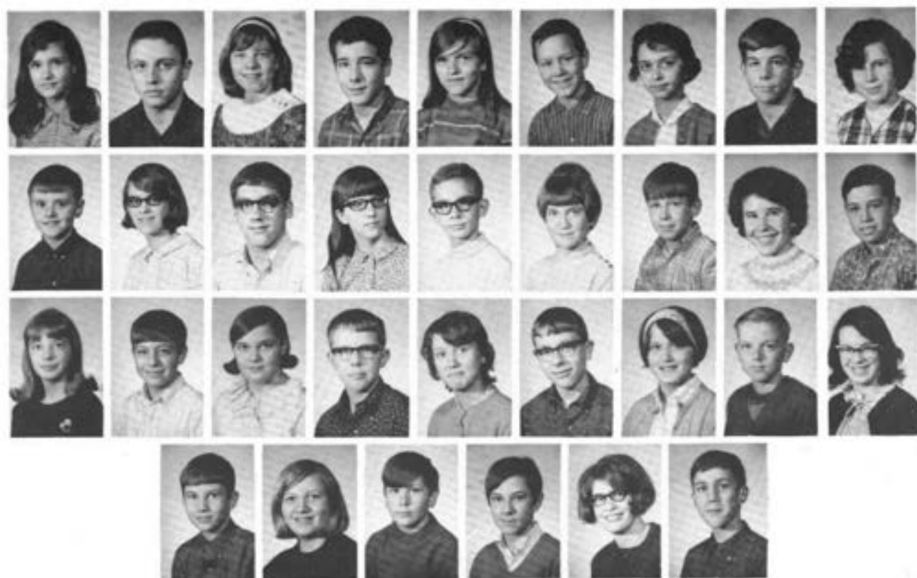
GRADE - 7