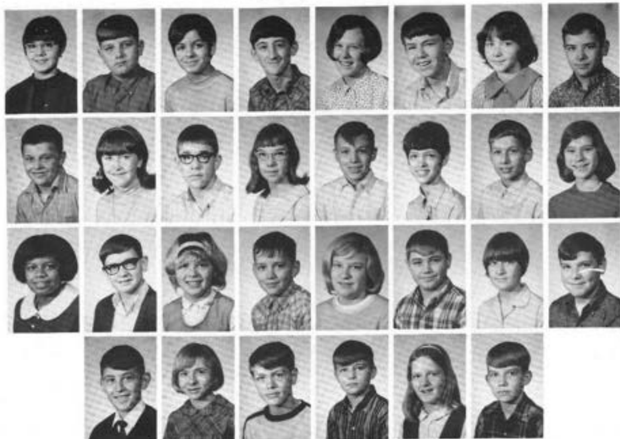
GRADE - 7