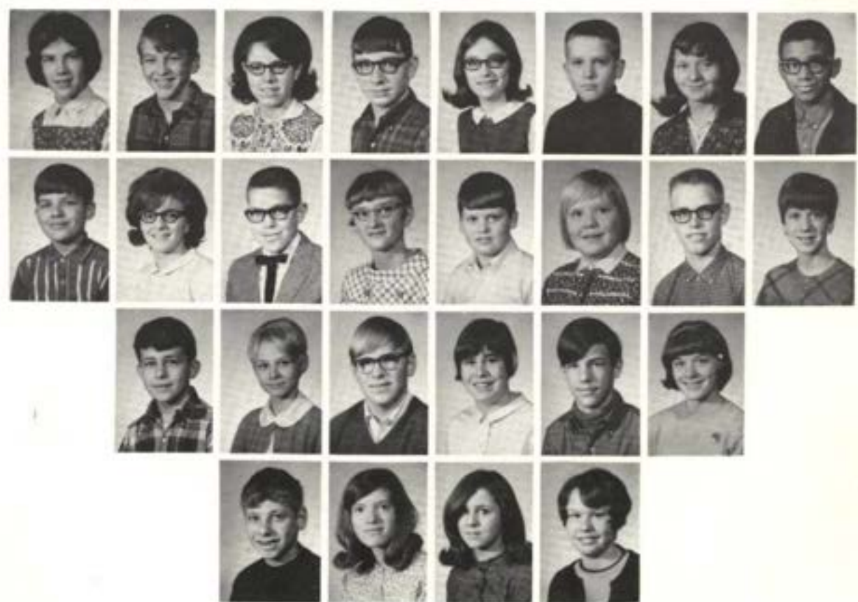
GRADE - 8