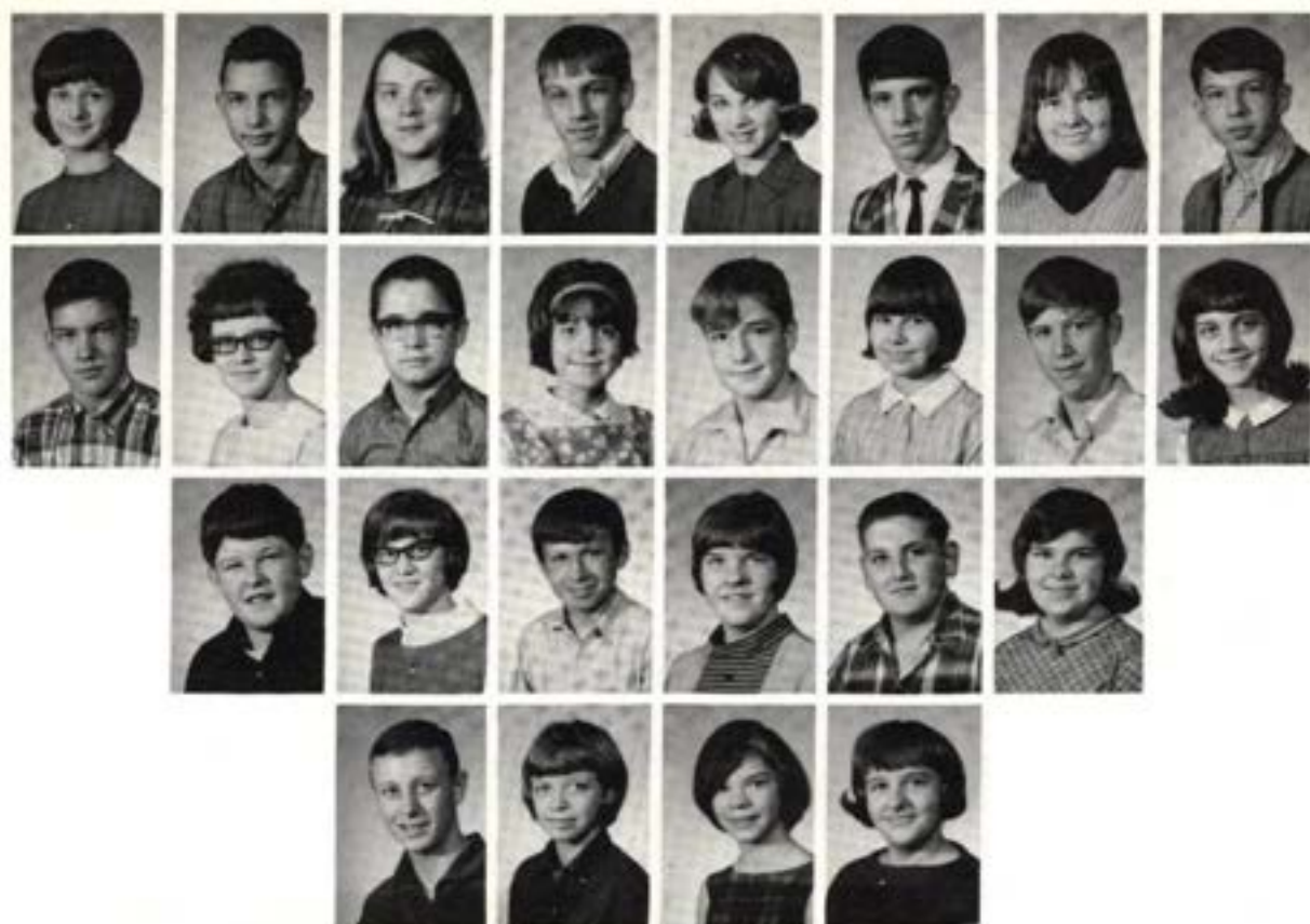
GRADE - 8