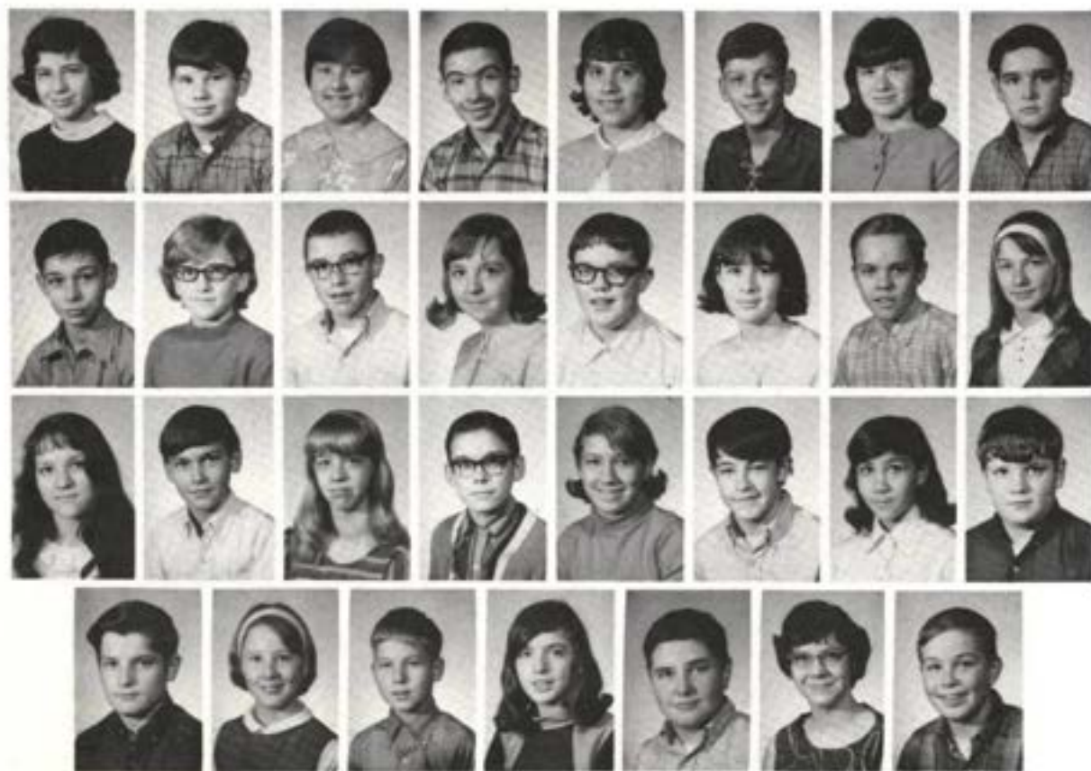
GRADE - 7