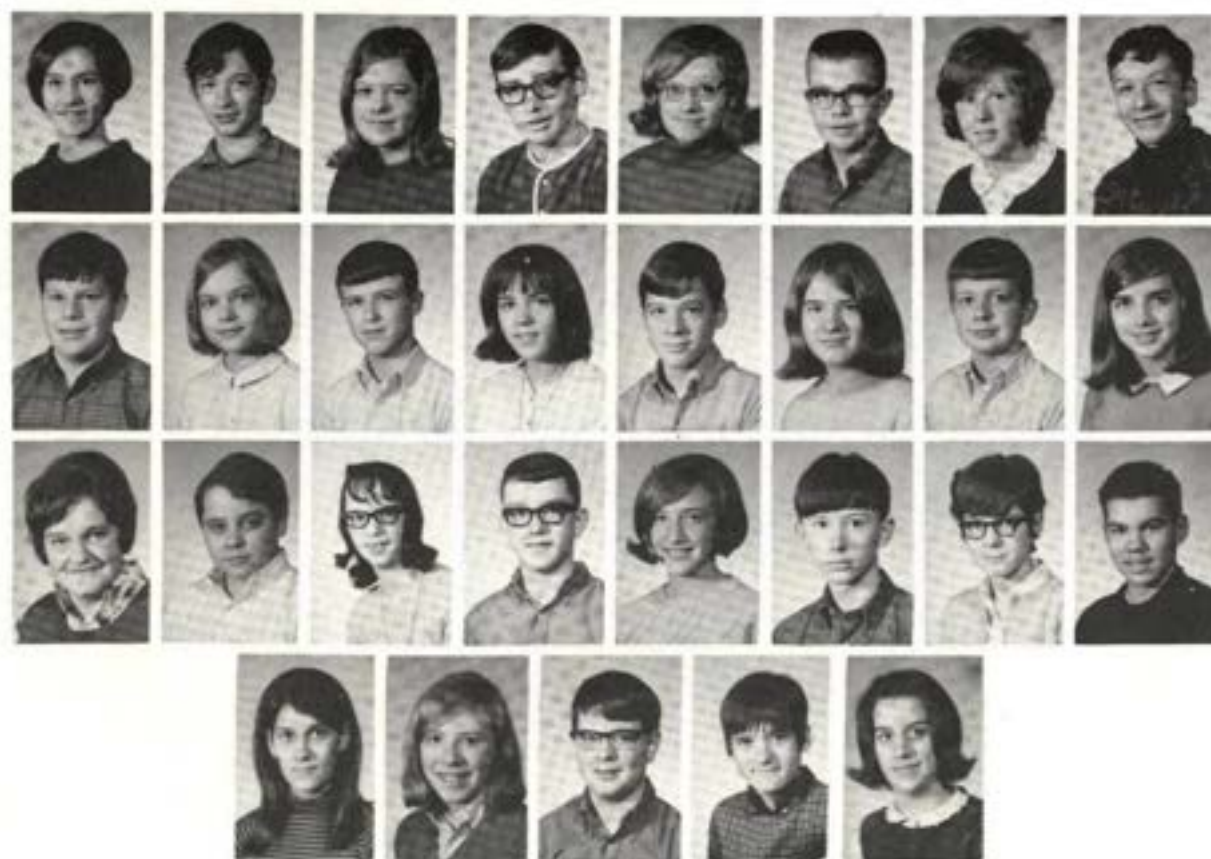
GRADE - 8