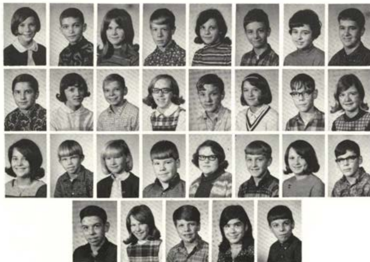
GRADE - 7