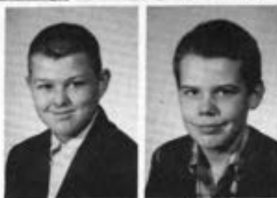
GRADE - 8