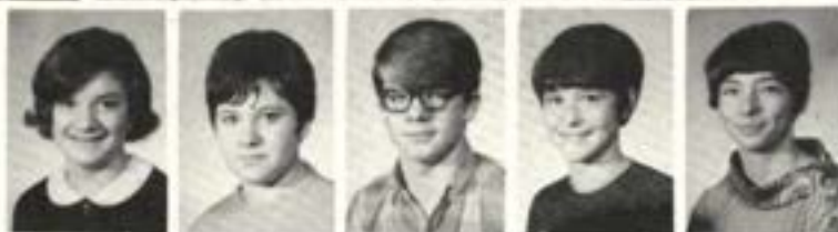
GRADE - 8