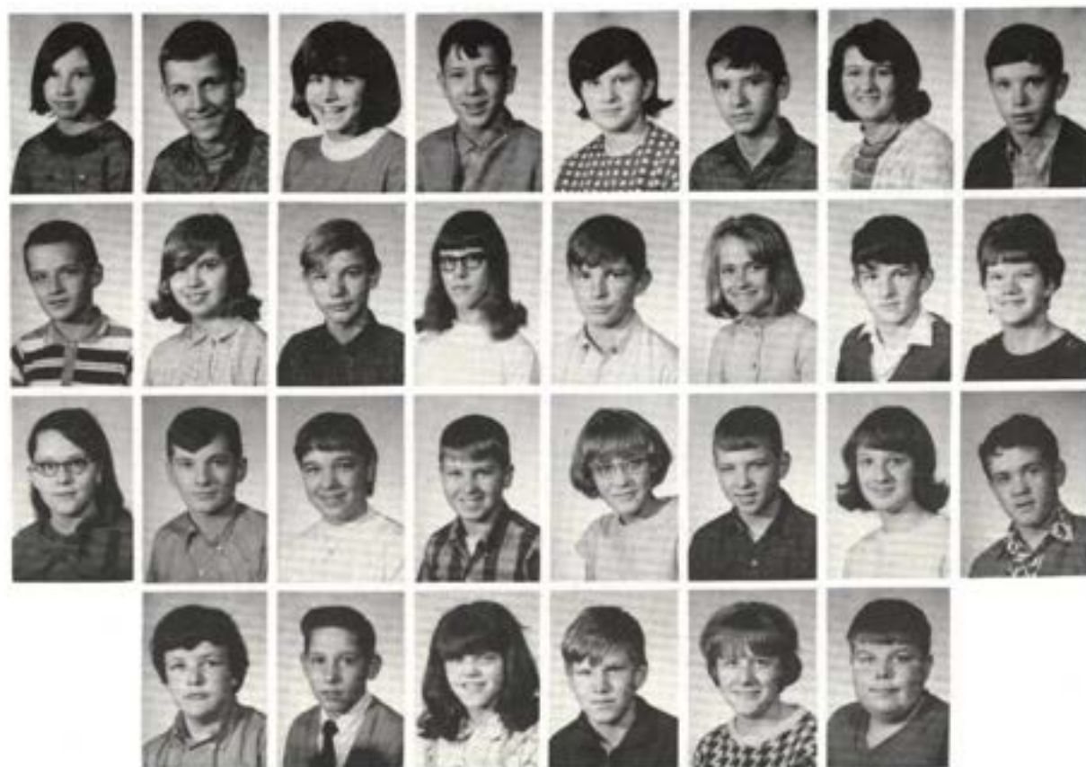
GRADE - 7