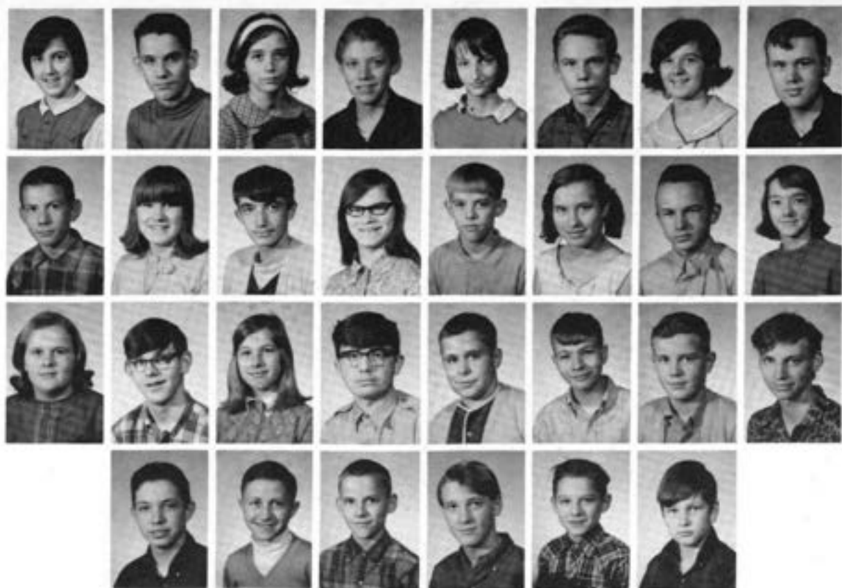
GRADE - 7