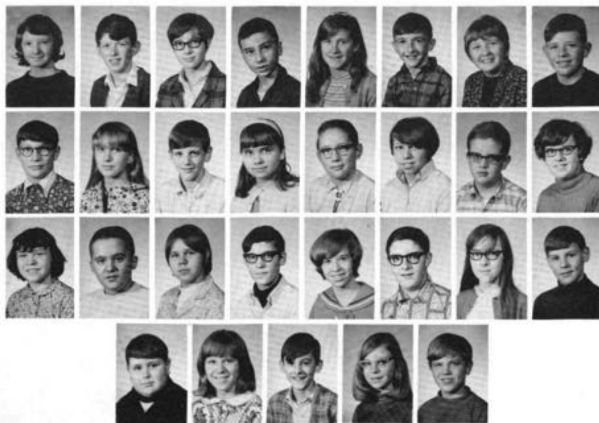
GRADE - 7