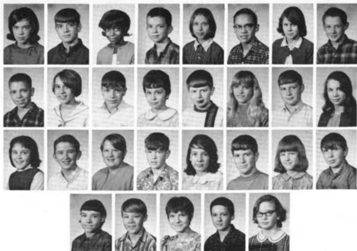
GRADE - 7