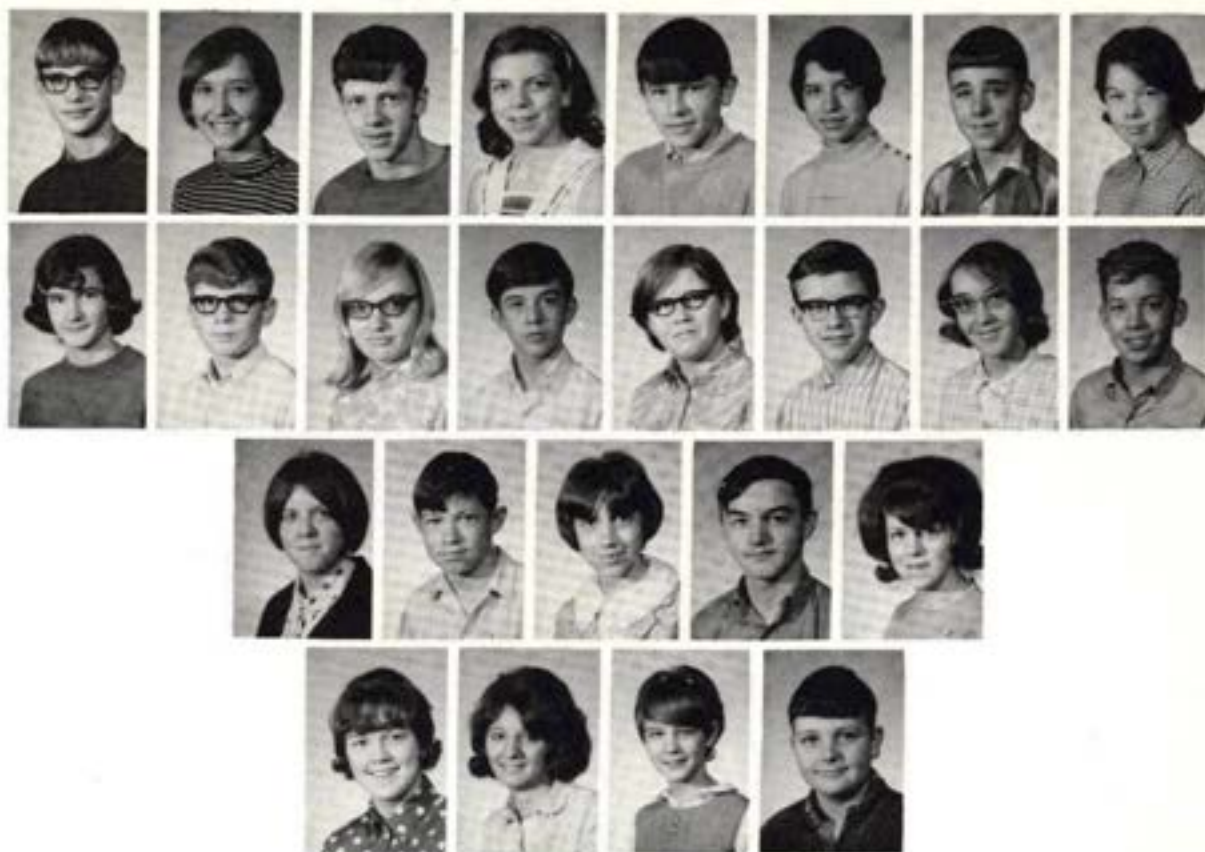
GRADE - 8