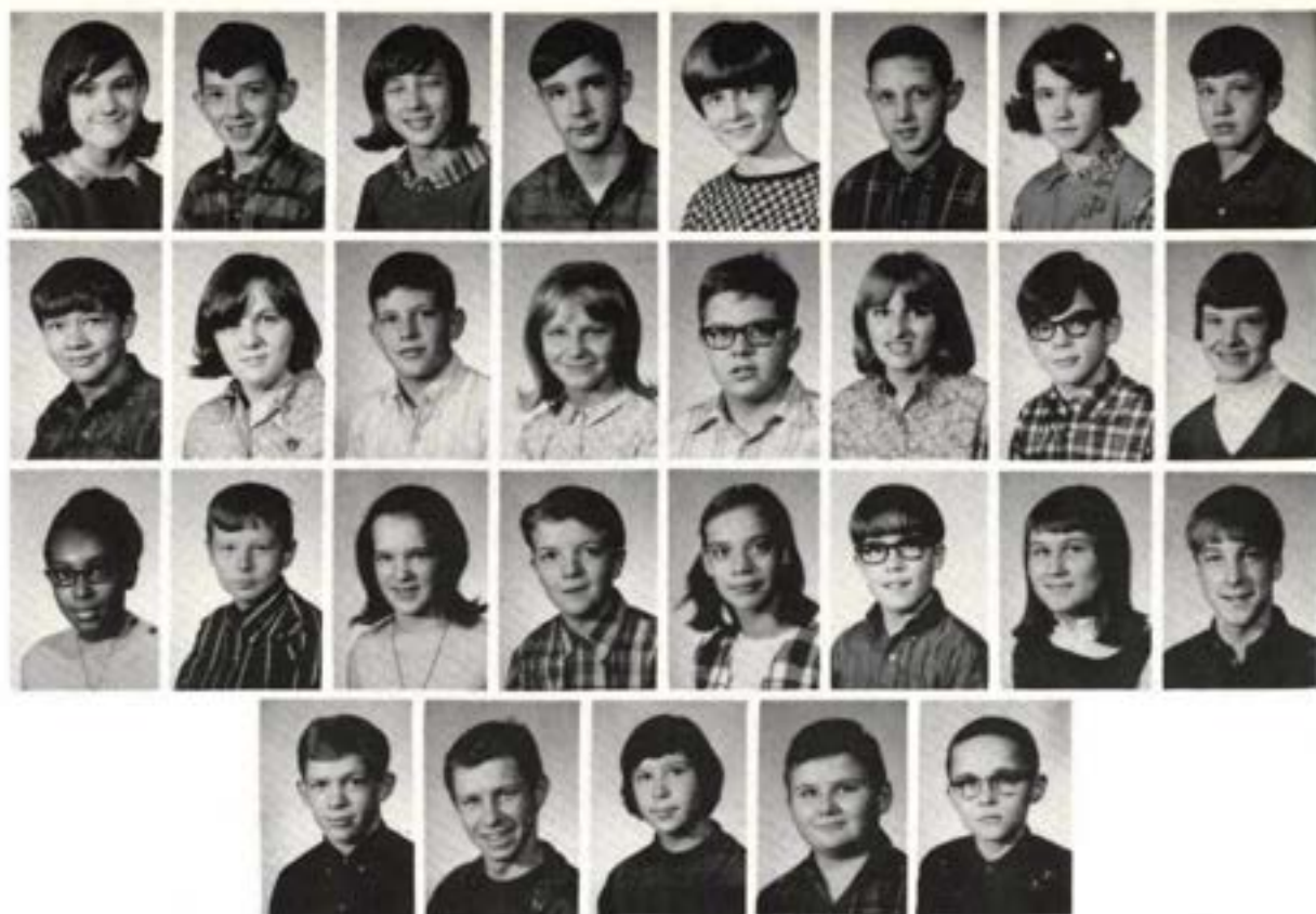
GRADE - 7