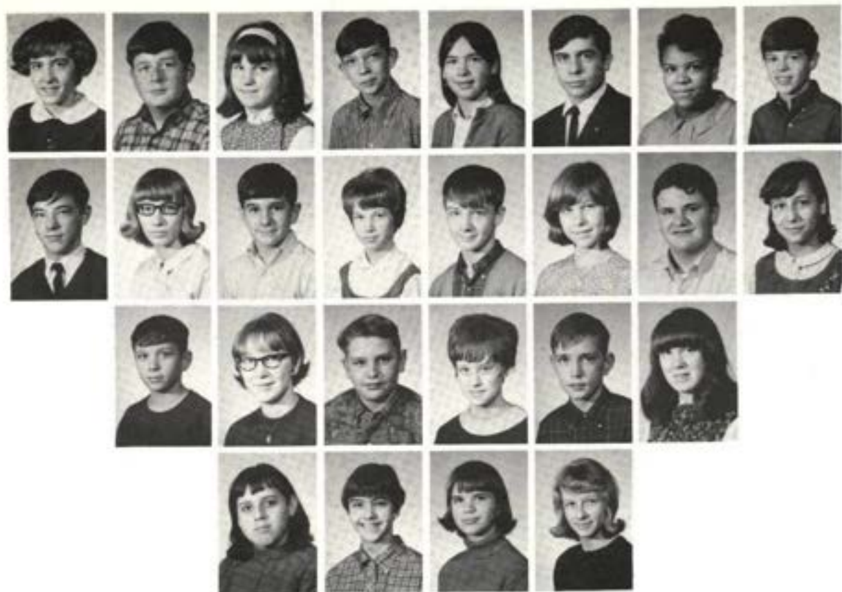
GRADE - 8