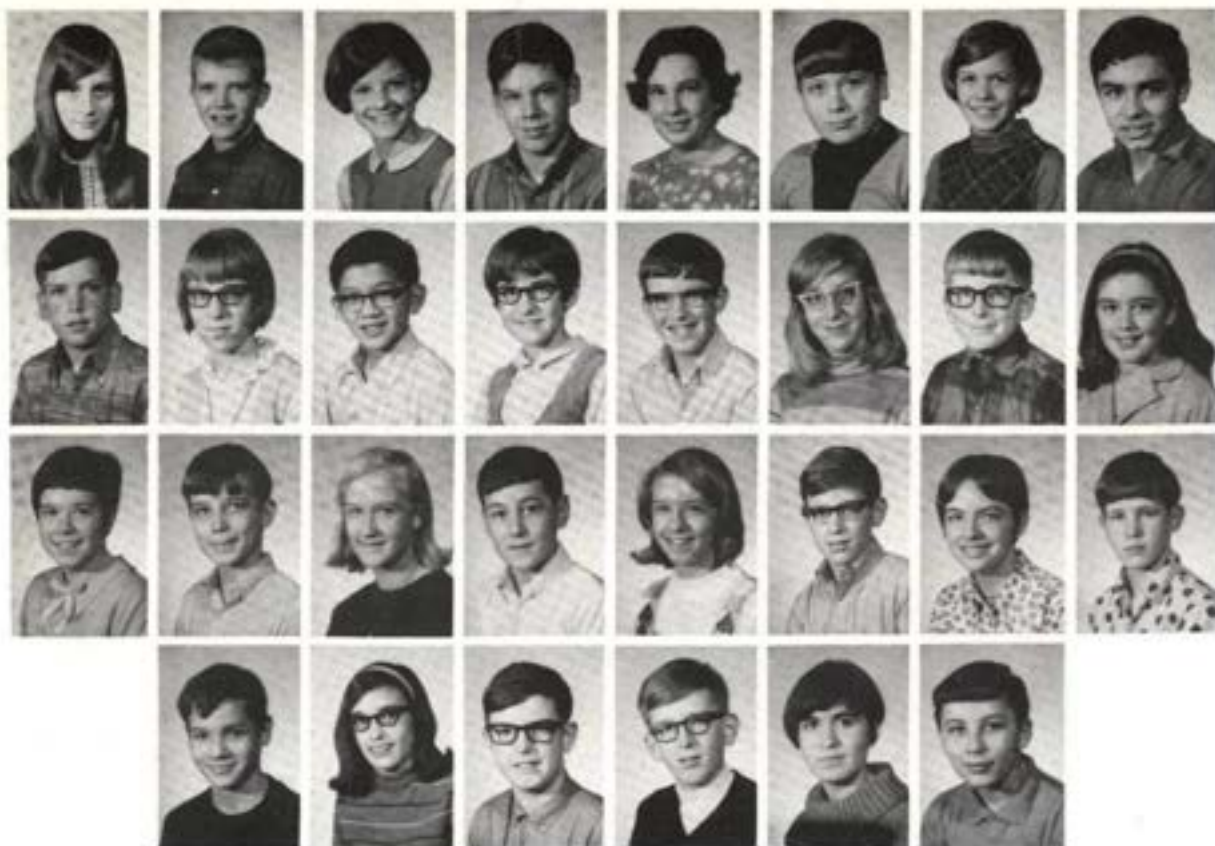
GRADE - 7