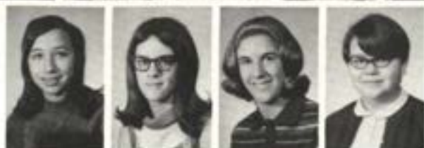
GRADE - 8