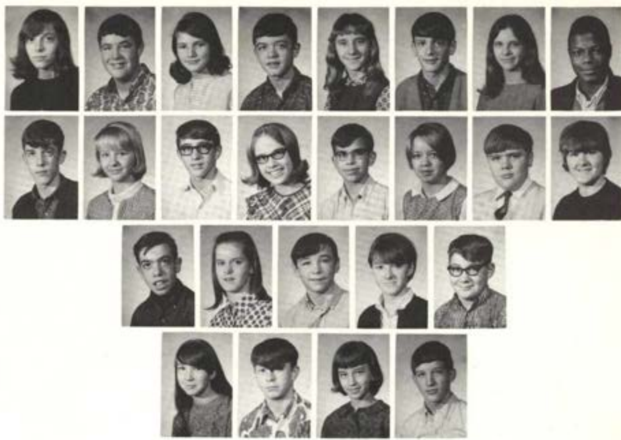
GRADE - 8