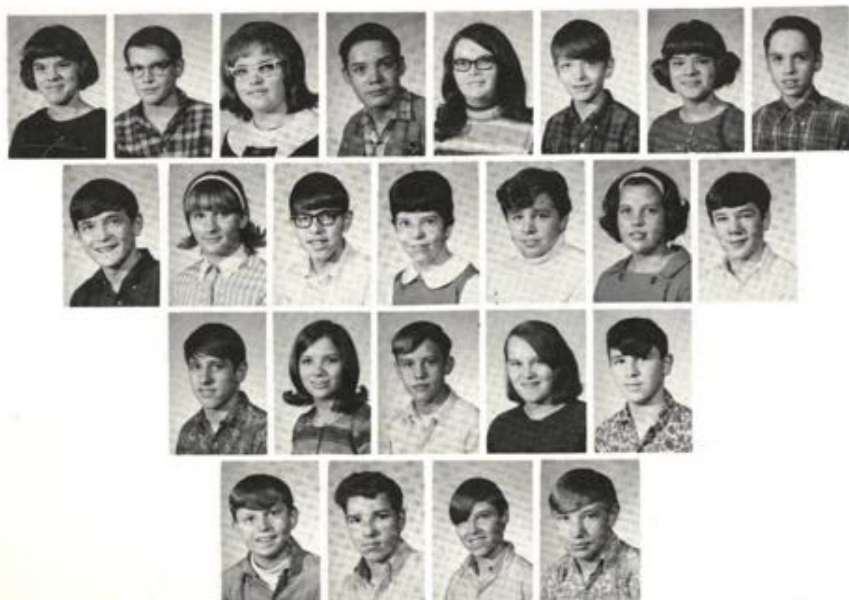
GRADE - 8