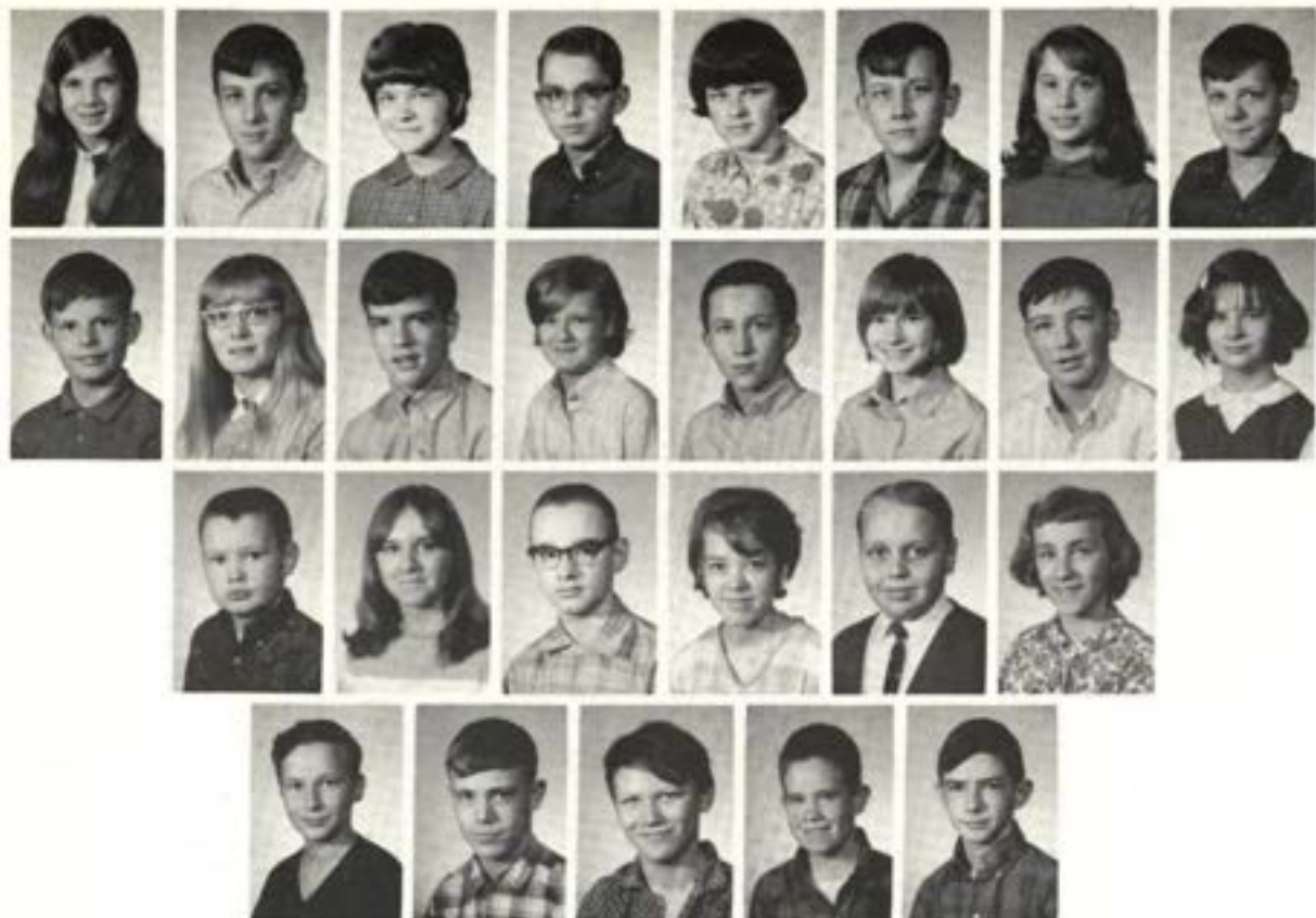
GRADE - 7