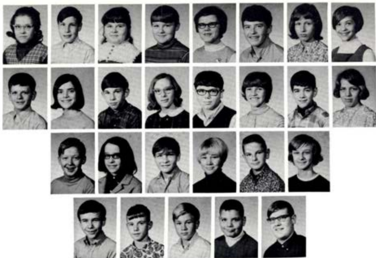
GRADE - 7