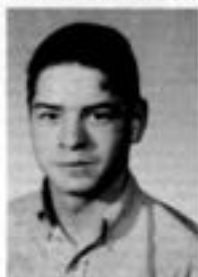
GRADE - 8