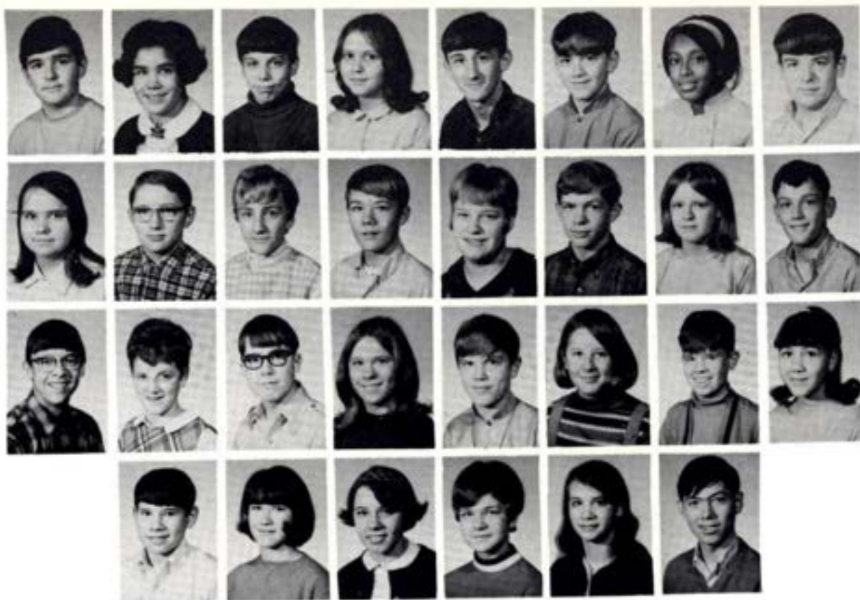
GRADE - 8