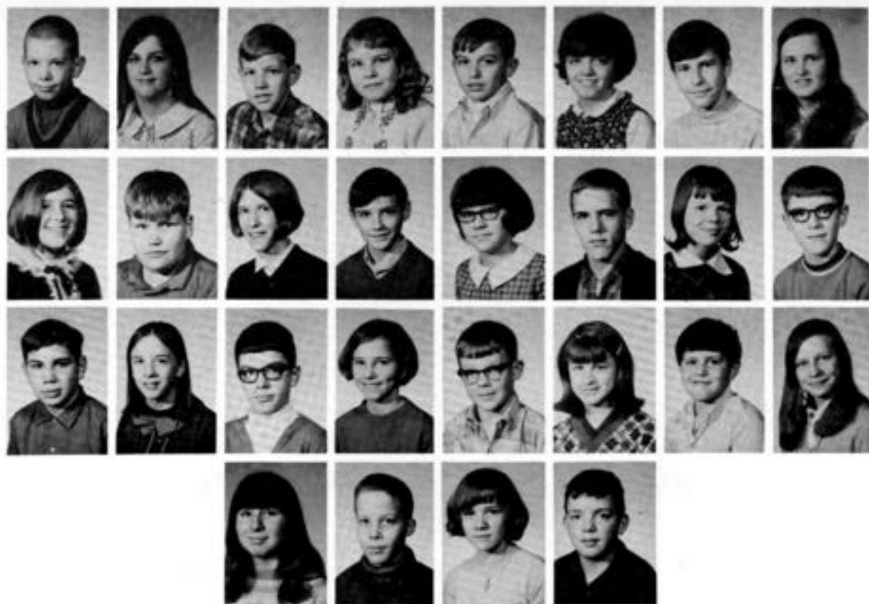
GRADE - 7