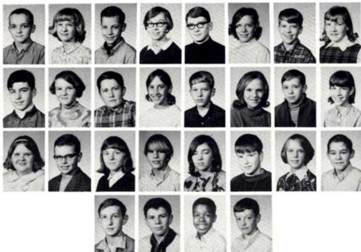
GRADE - 7