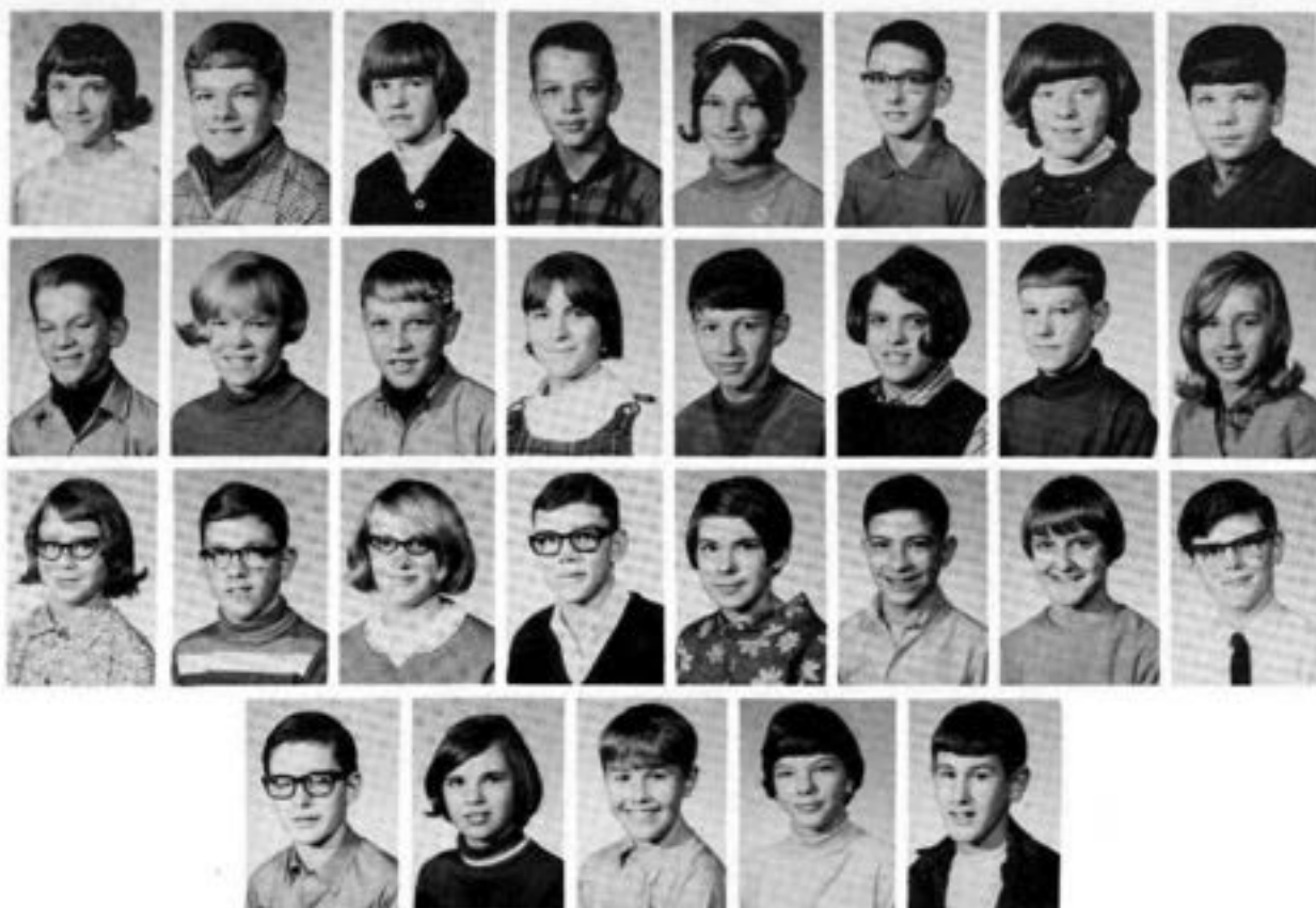
GRADE - 7