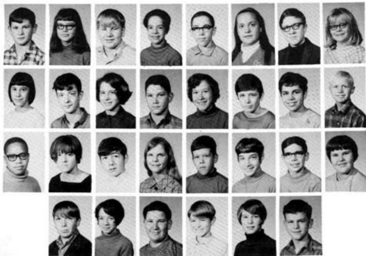
GRADE - 7