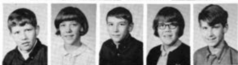
GRADE - 7