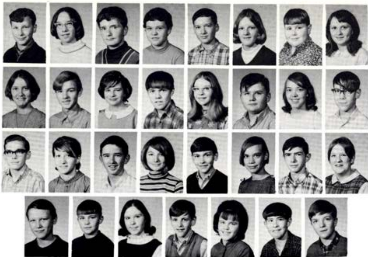
GRADE - 8