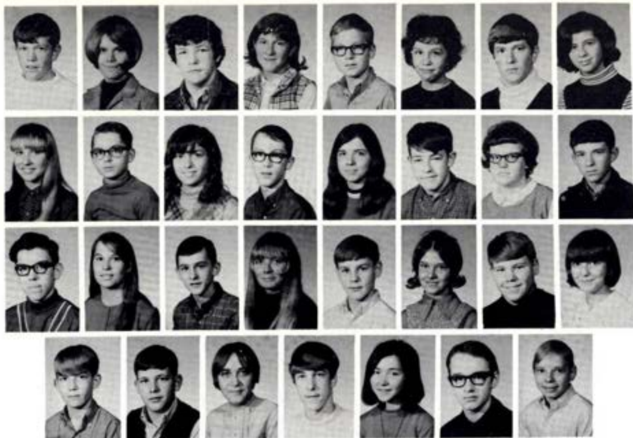
GRADE - 8