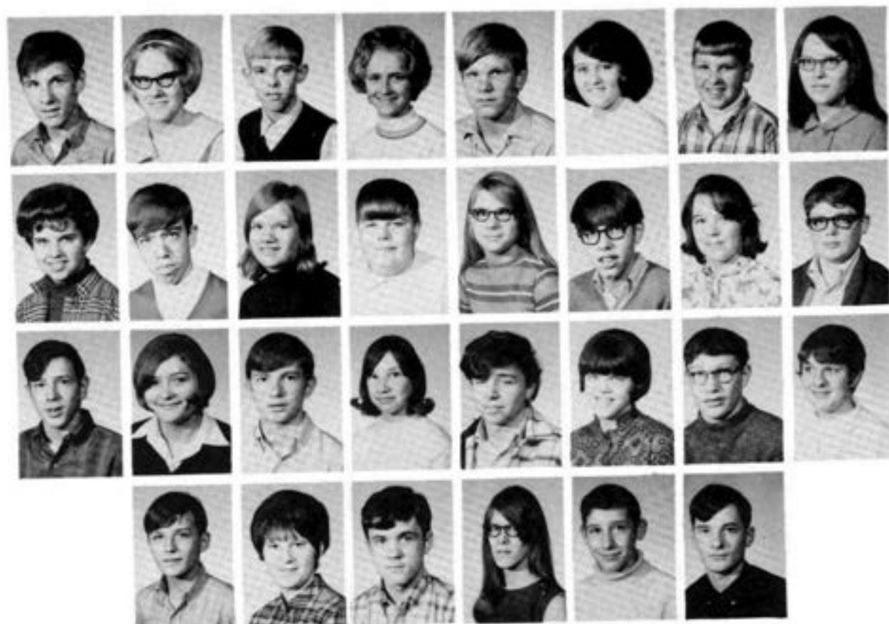
GRADE - 8