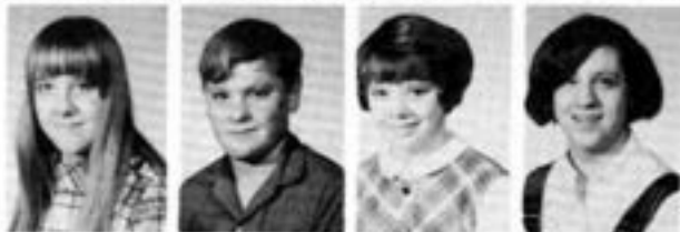
GRADE - 7