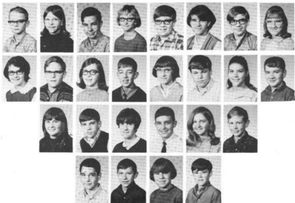
GRADE - 7