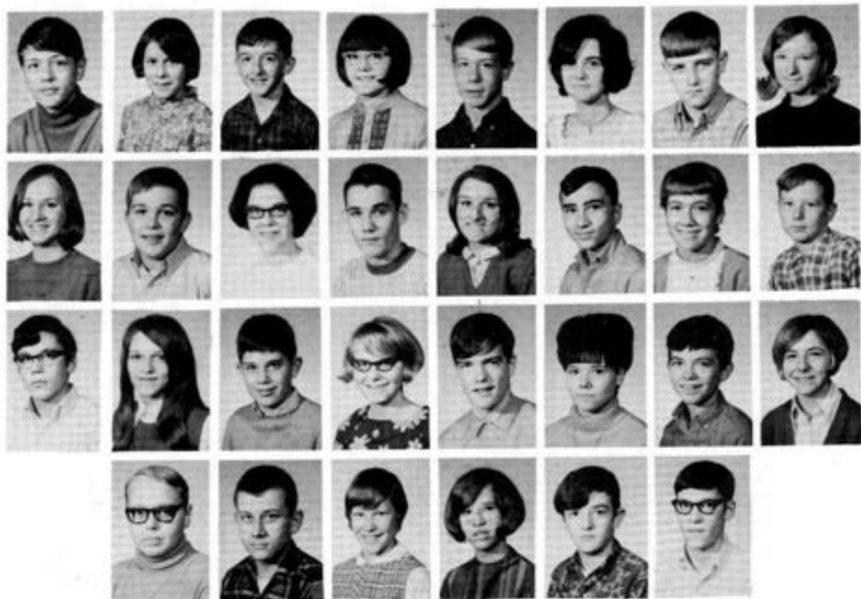
GRADE - 8