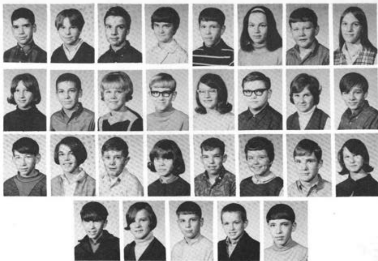
GRADE - 7