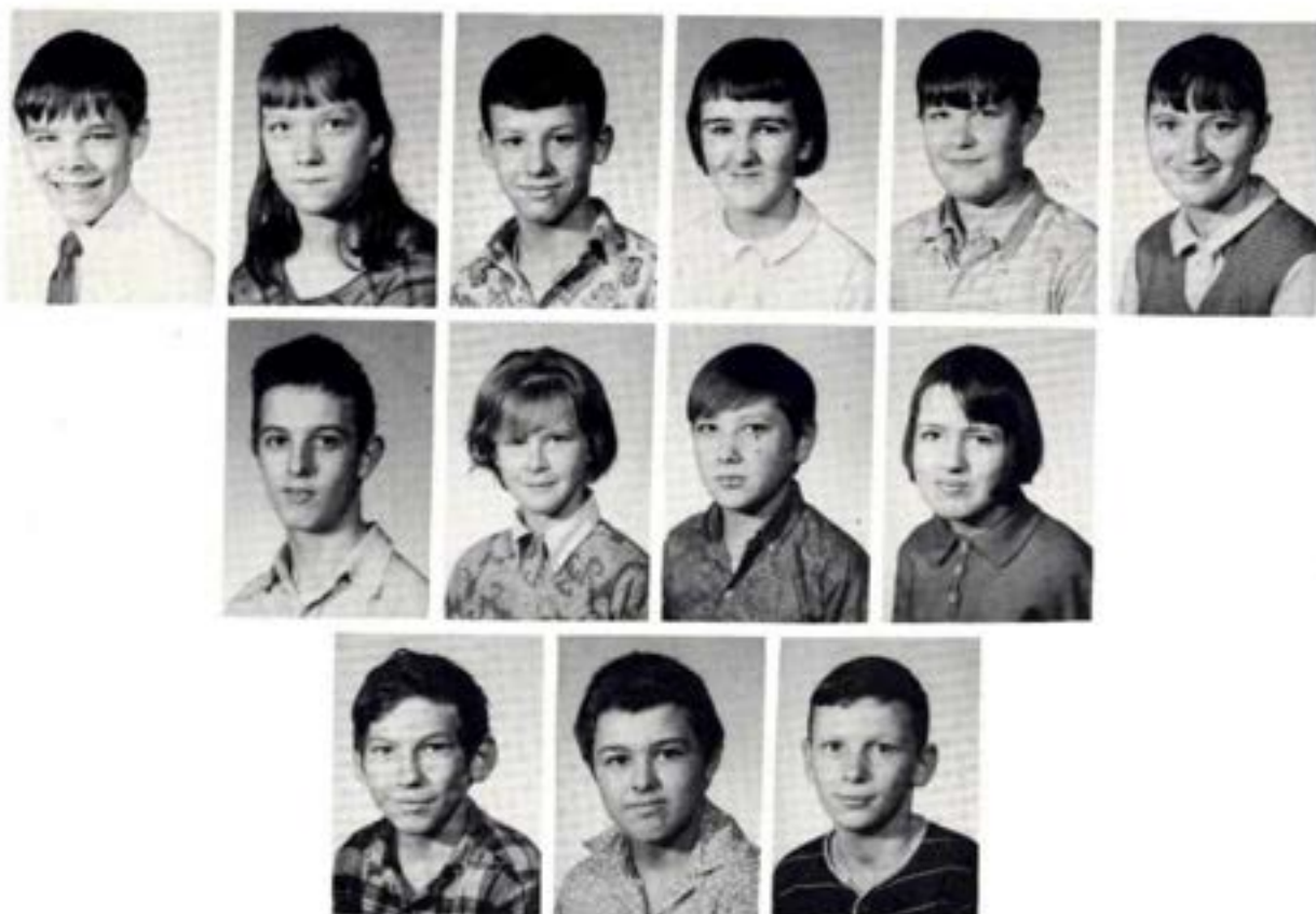
GRADE - 8