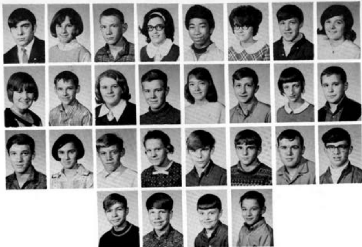
GRADE - 8