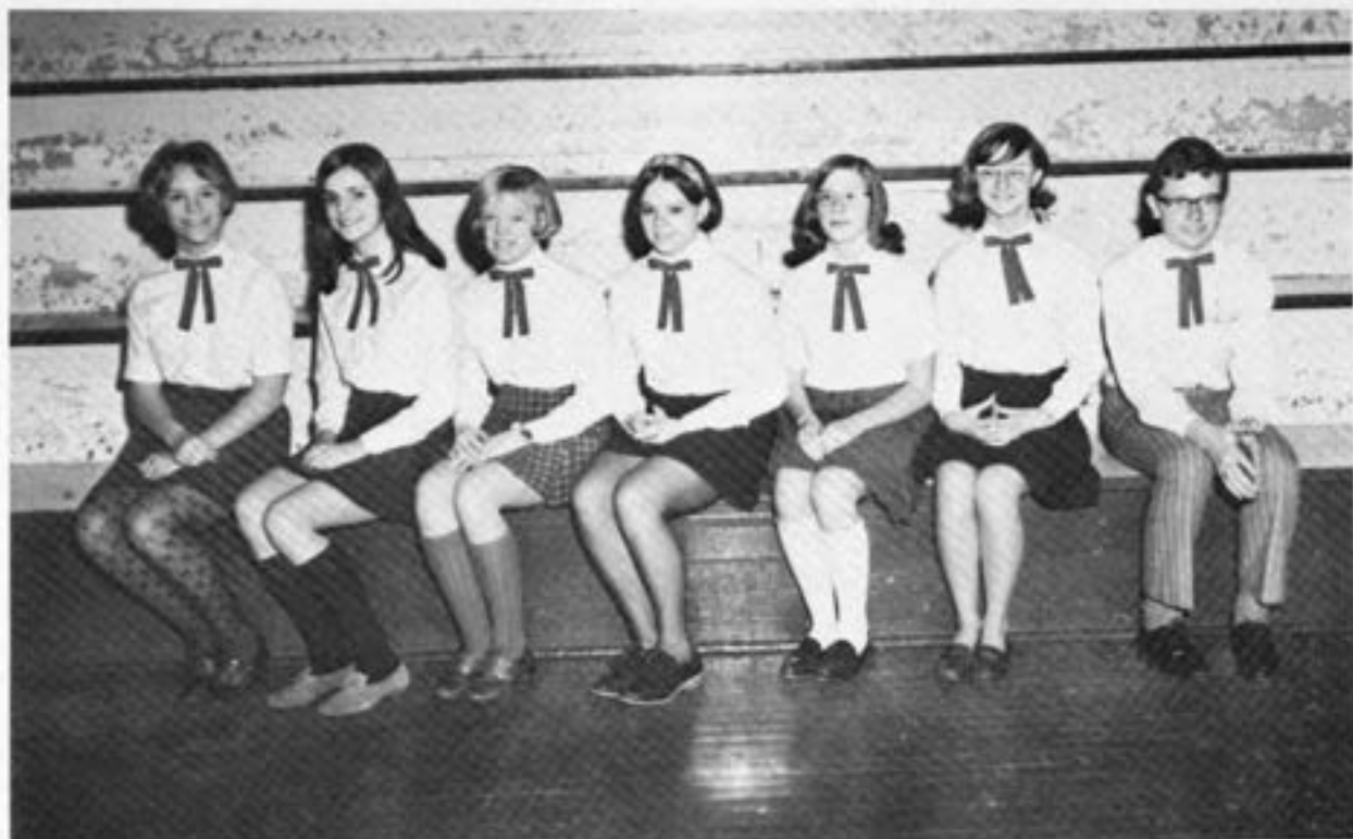
SUPERIOR RATING AT CLARKSVILLE MUSIC CONTEST