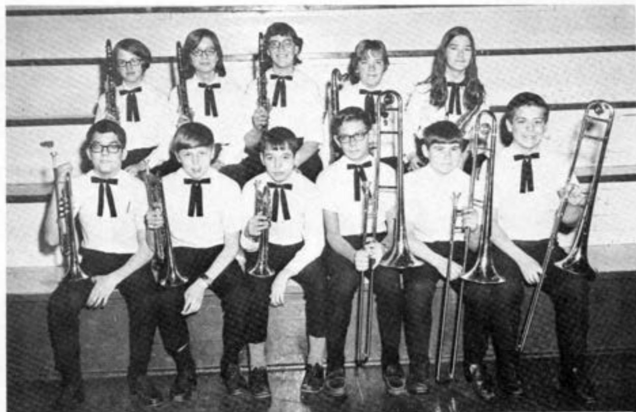
ENSEMBLE CONTEST WINNERS