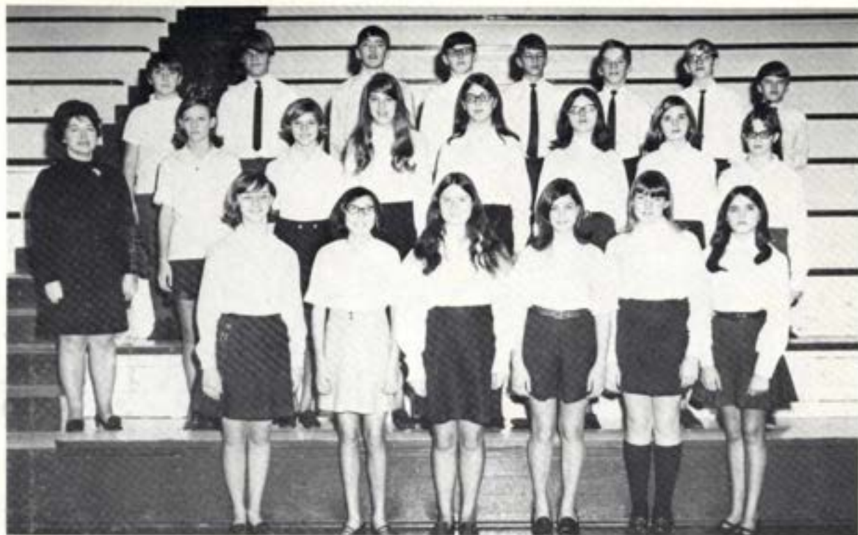
8TH GRADE ENSEMBLE "TWELVE TONES" AND "OCTAVES"