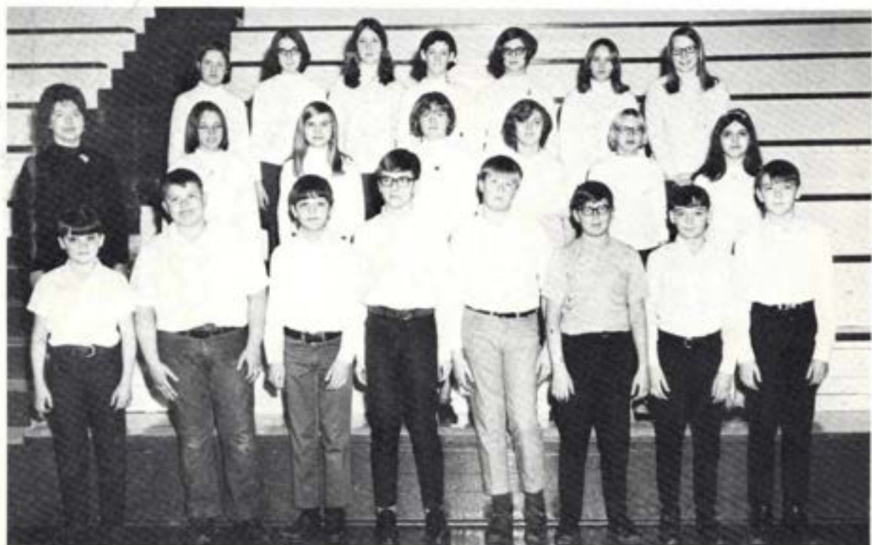
7TH GRADE ENSEMBLE "FORTUNATE EIGHT" AND "LUCKY THIRTEEN"