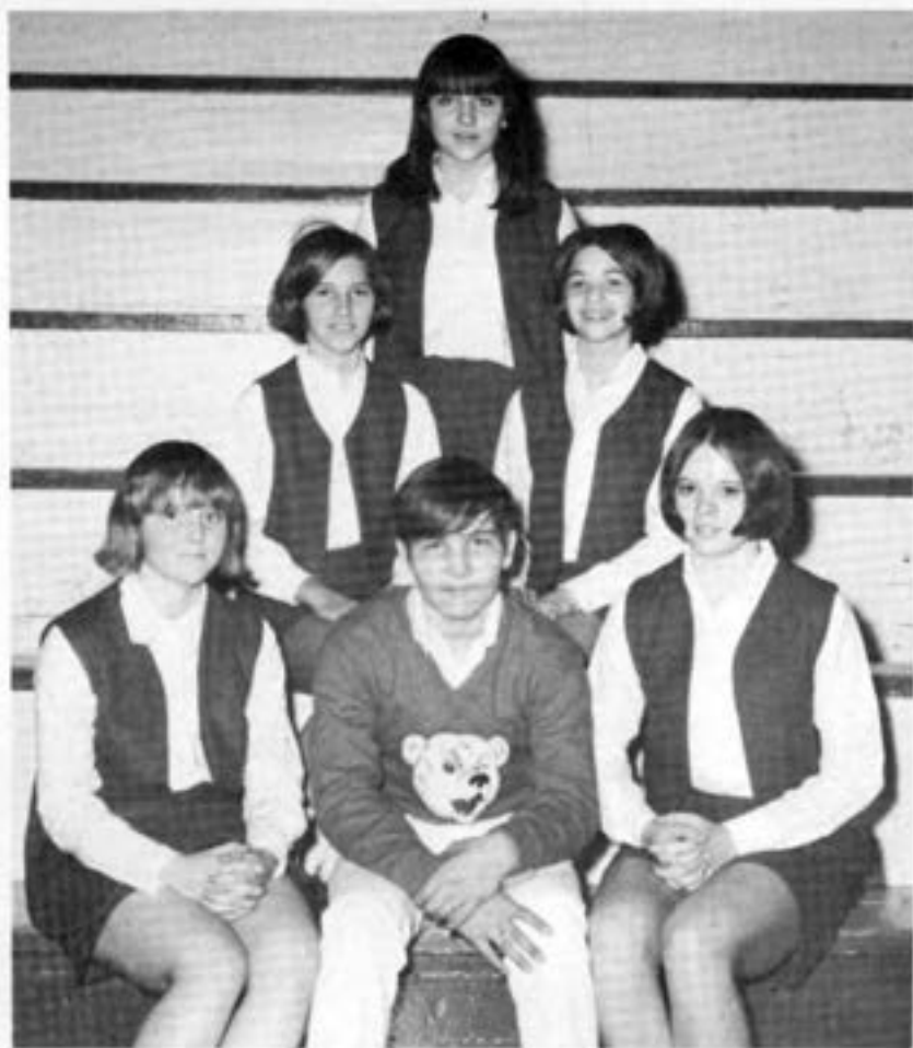
8TH GRADE "CHEERLEADERS"