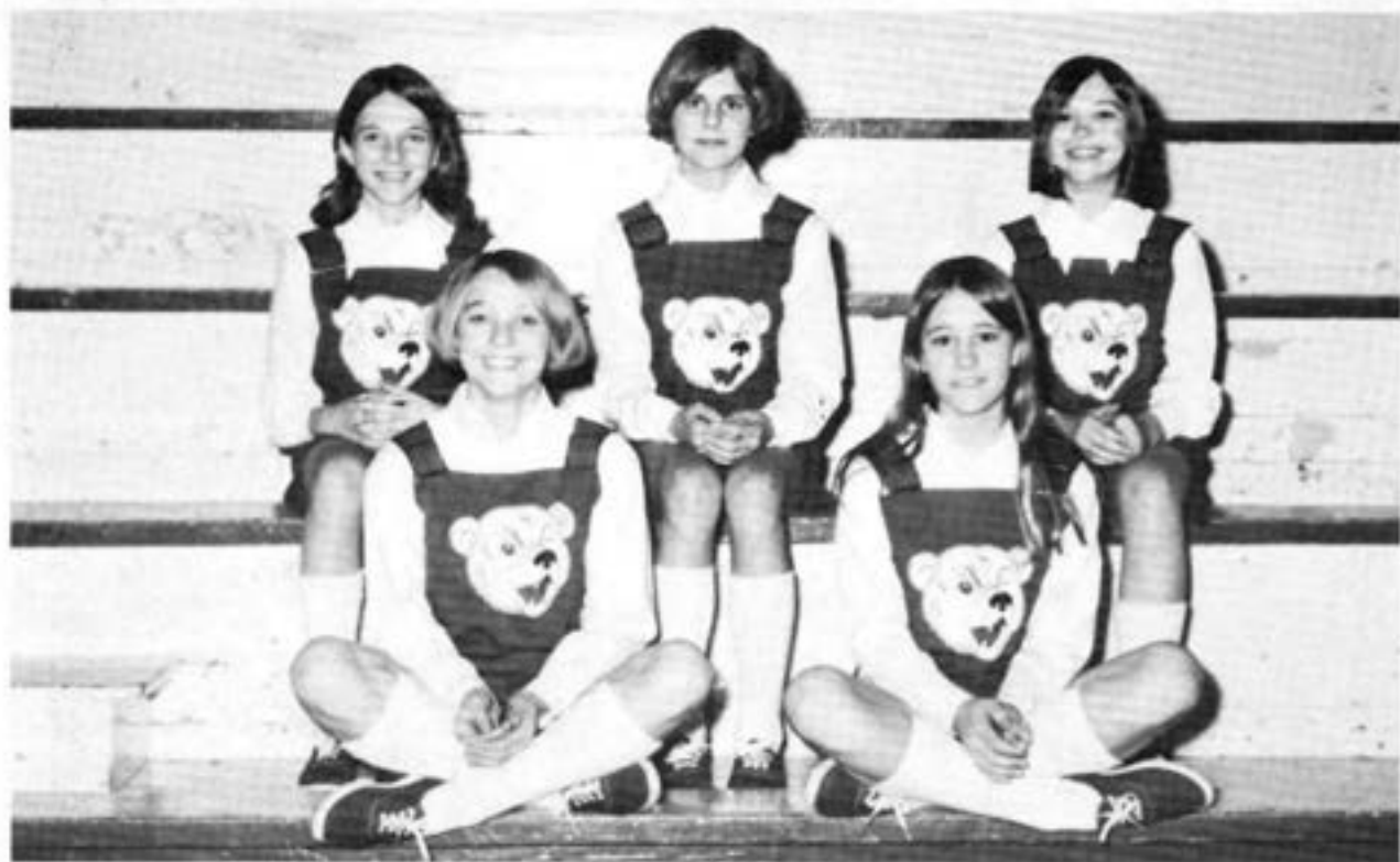
7TH GRADE "CHEERLEADERS"