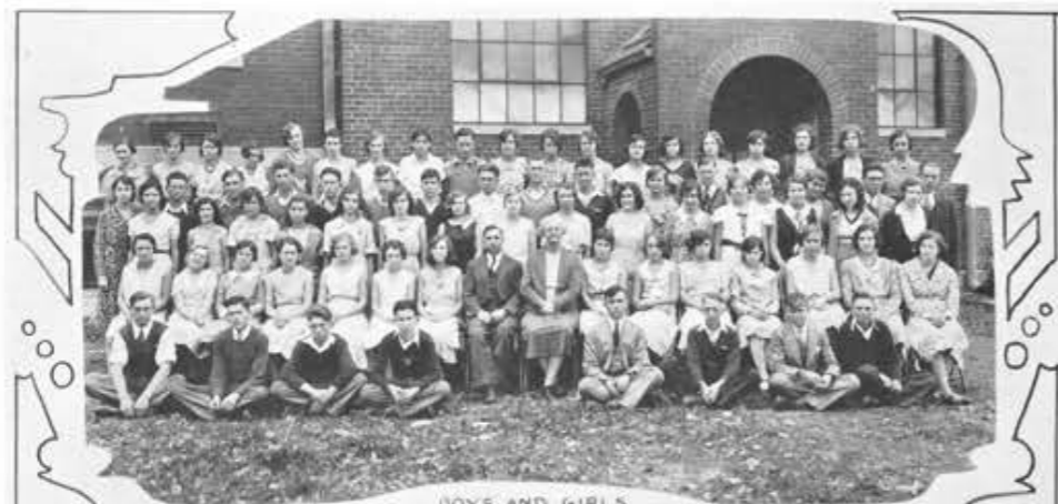
BOYS AND GIRLS GLEE CLUB