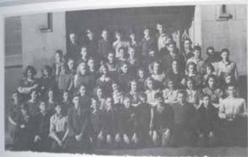
Grades 7 & 8