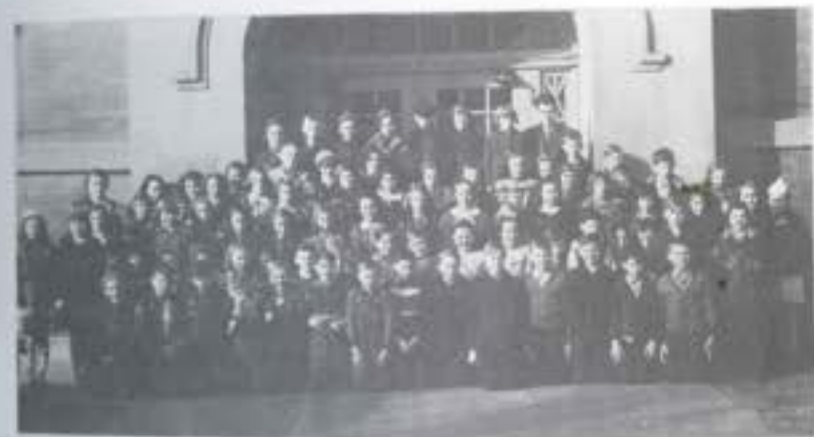
Grades 4, 5, & 6