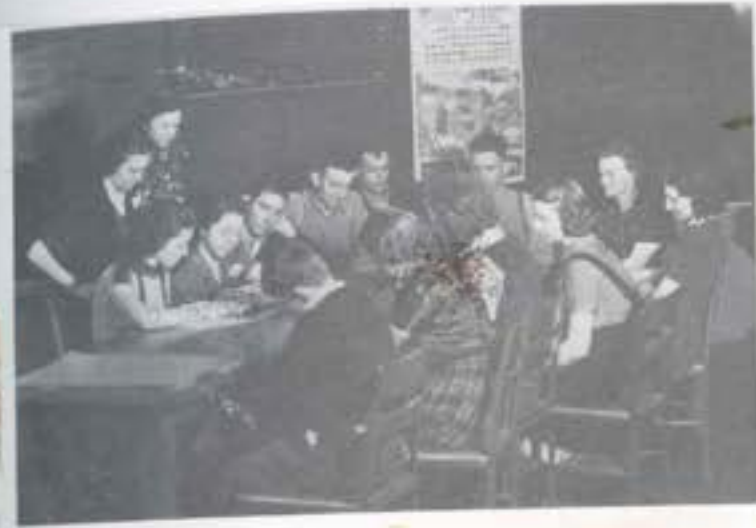
THE STUDENT COUNCIL

As we come to the close of this year; we look forward to next year when we shall be able to carry out more fully the ideals we have strived to attain.