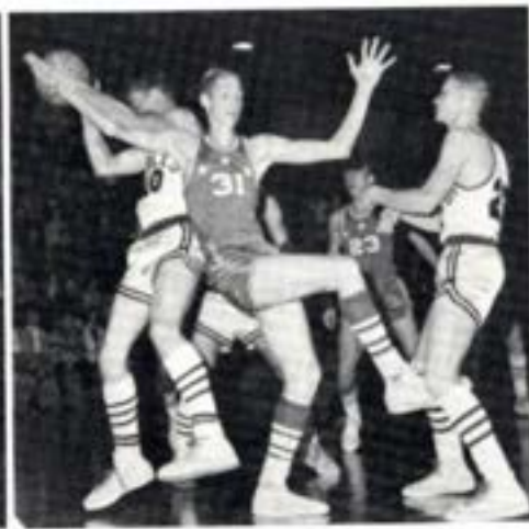
Who put the starch in my deodorant????????????????