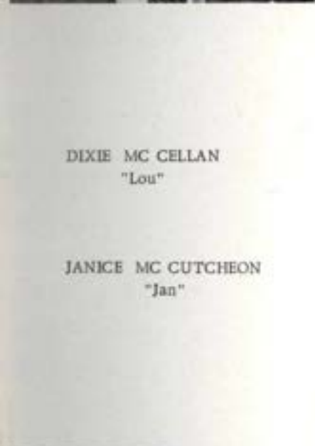
DIXIE MC CELLAN "Lou"