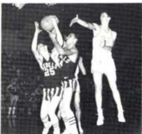
"Will somebody hold my hand."