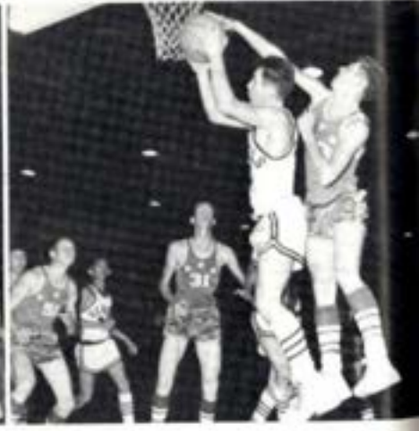
A little more salt please!!