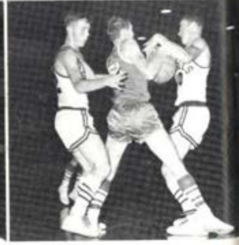
Ah! Come on--give it to him.....