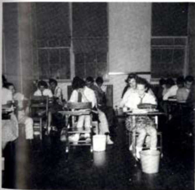
Freshmen Initiation! Keep working.