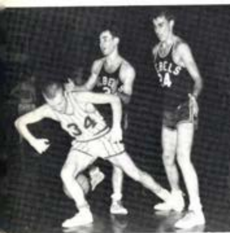
Come on, Baby, Let's do the Twist.....