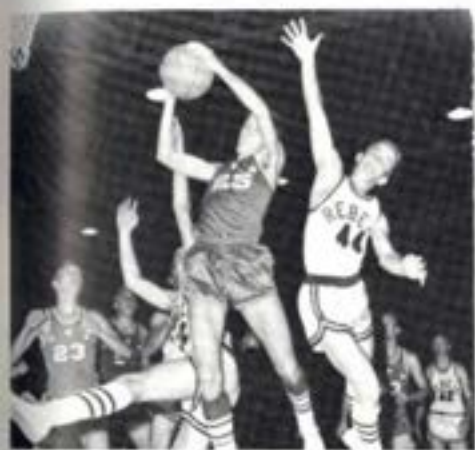
"But coach, I'M TRYIN".