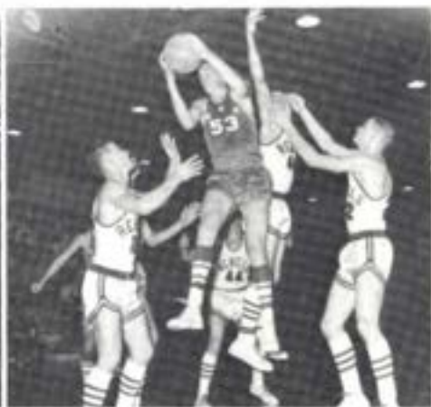
"May we help you."