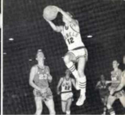
"And he sails through the air"