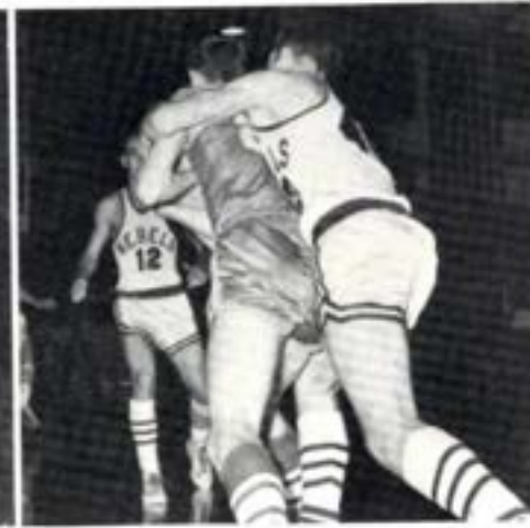
Love Me Tender