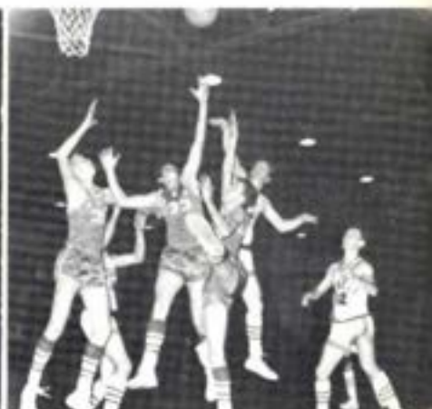
"Look, it's up there!"