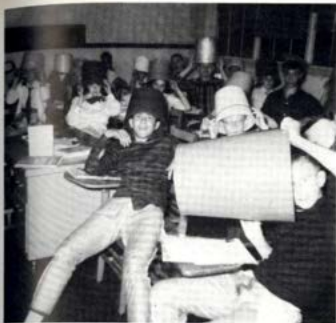
Freshmen learning to put out a fire!