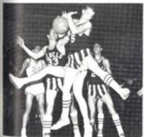
"I said, Give it to me."