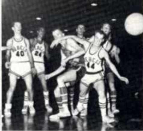
"Out of my way, It's mine."