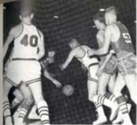
"Let me get it, for you."